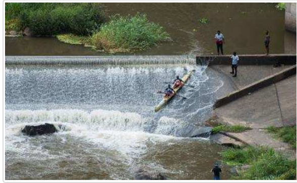
Marathon crowns at Blue Lagoon on Saturday.